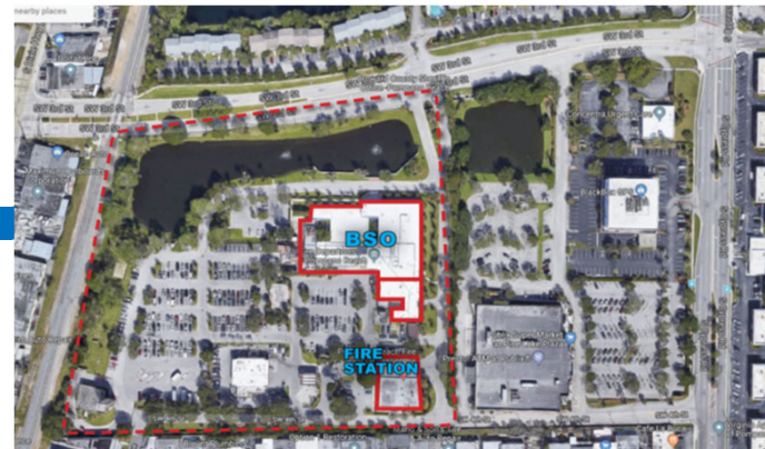
PUBLIC SAFETY COMPLEX