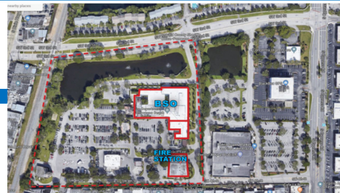
PUBLIC SAFETY COMPLEX