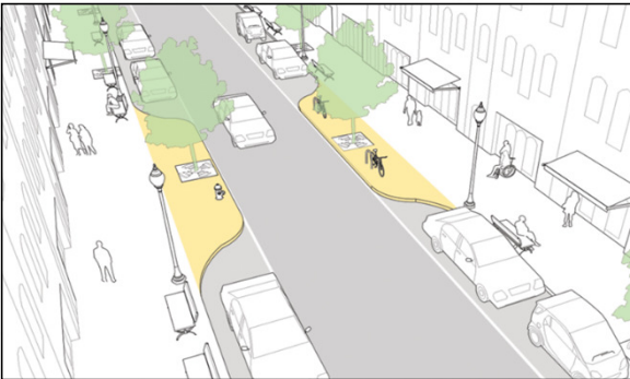
Mid-Block Bulb-Out (Roadway Narrowing)