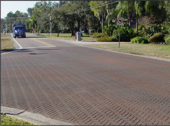
Textured Pavement Intersection