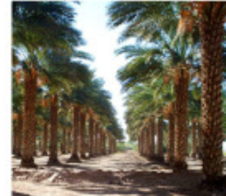
Medjool Date Palm