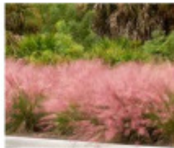
Pink Muhly Grass