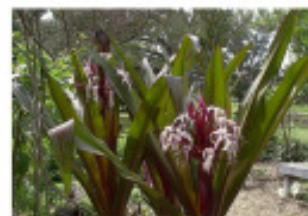
Queen Emma Crinum