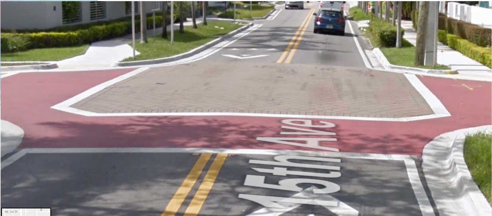
NE 1st St