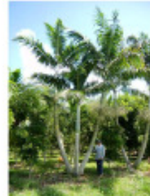
Triple Montgomery Palm