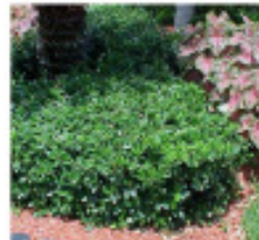
Green Island Ficus