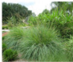
Dwarf Fakahatchee Grass