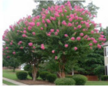
Queen's Crape Myrtle