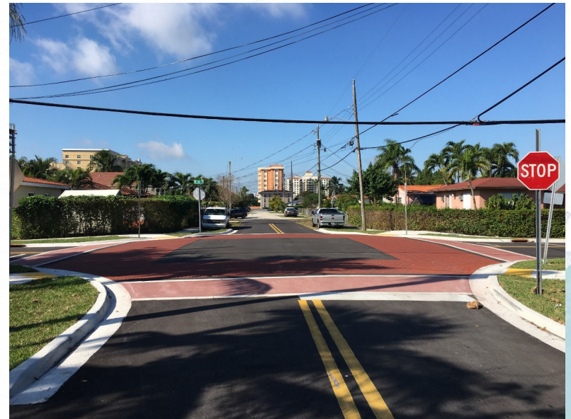
Raised Intersection with Textured Pavement